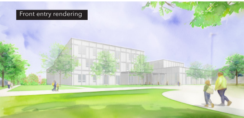
Front entry rendering

Following the school board's direction to reduce costs, the project team has developed an updated design that maintains the academic, athletic, and extracurricular spaces that all modernized PPS high schools have. The cost reductions have resulted in an optimized building layout that simplifies the structural and heating/cooling systems. The project team has worked diligently to realize savings while keeping design features that were prioritized by the IBW community.